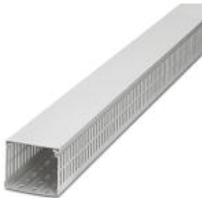
Cable duct, white, comprising upper part and mounting base, width: 25 mm, height: 60 mm, length: 2000 mm

Please be informed that the data shown in this PDF Document is generated from our Online Catalog. Please find the complete data in the user's documentation. Our General Terms of Use for Downloads are valid ( http://download.phoenixcontact.com )