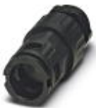
Cable gland, metric thread, IP68/69k protection, with strain relief

Screw connection - WP-GR HF IP69K M12 BK - 3240938