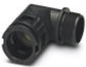
Cable gland, metric thread, IP68/69k protection, angled

Screw connection - WP-GA HF IP69K M16 BK - 3240911