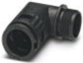
Cable gland, metric thread, IP66 protection, angled

Screw connection - WP-GA HF IP66 M16 BK - 3240925