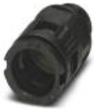
Cable gland, metric thread, IP68/69k protection, straight

Screw connection - WP-G HF IP69K M16 BK - 3240883