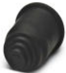
End sleeves, transition sleeves, from hose to cable

Transition sleeve from hose to cable - WP-EC TPE HF 15,8 BK - 3240976