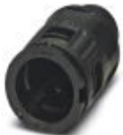
Cable gland, metric thread, IP66 protection, straight

Screw connection - WP-G HF IP66 M16 BK - 3240897