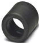
End sleeves as cable protection

Cable protection end sleeve - WP-SC PA HF 15,8 BK - 3240983