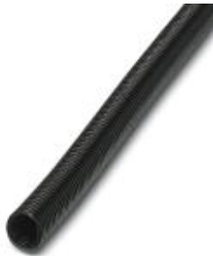
Polyamide protective hose, inflammability class V0, UV resistant

Please be informed that the data shown in this PDF Document is generated from our Online Catalog. Please find the complete data in the user's documentation. Our General Terms of Use for Downloads are valid ( http://phoenixcontact.com/download )