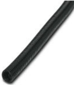
Polyamide protective hose, inflammability class HB, UV resistant

Please be informed that the data shown in this PDF Document is generated from our Online Catalog. Please find the complete data in the user's documentation. Our General Terms of Use for Downloads are valid ( http://phoenixcontact.com/download )