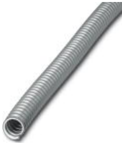
Protective hose, spring steel wire with PVC coating, highly stranded

Please be informed that the data shown in this PDF Document is generated from our Online Catalog. Please find the complete data in the user's documentation. Our General Terms of Use for Downloads are valid ( http://phoenixcontact.com/download )