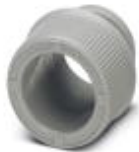
End sleeves as cable protection

Cable protection end sleeve - WP-SC HF 17 - 3241018