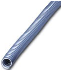
Protective hose, spring steel wire with PU coating, highly stranded

Please be informed that the data shown in this PDF Document is generated from our Online Catalog. Please find the complete data in the user's documentation. Our General Terms of Use for Downloads are valid ( http://phoenixcontact.com/download )