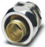
Cable gland made from brass with metric thread, IP65 protection

Screw connection - WP-G BRASS IP65 M12 - 3241059