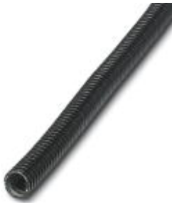
Galvanized steel protective hose with PVC coating

Please be informed that the data shown in this PDF Document is generated from our Online Catalog. Please find the complete data in the user's documentation. Our General Terms of Use for Downloads are valid ( http://phoenixcontact.com/download )