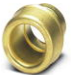
End sleeves as cable protection, made of brass, for WP-STEEL PVC C

Cable protection end sleeve - WP-SC BRASS WP PVC 14 - 3241073