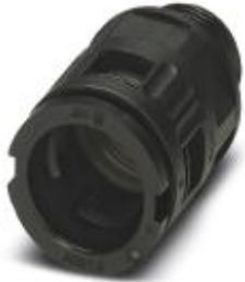
Cable gland, metric thread, IP68/69k protection, straight

Please be informed that the data shown in this PDF Document is generated from our Online Catalog. Please find the complete data in the user's documentation. Our General Terms of Use for Downloads are valid ( http://phoenixcontact.com/download )