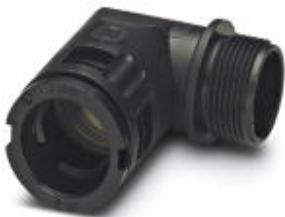
Cable gland, metric thread, IP68/69k protection, angled

Please be informed that the data shown in this PDF Document is generated from our Online Catalog. Please find the complete data in the user's documentation. Our General Terms of Use for Downloads are valid ( http://phoenixcontact.com/download )