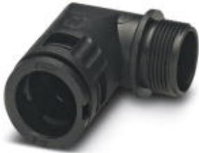
Cable gland, metric thread, IP66 protection, angled

Please be informed that the data shown in this PDF Document is generated from our Online Catalog. Please find the complete data in the user's documentation. Our General Terms of Use for Downloads are valid ( http://phoenixcontact.com/download )