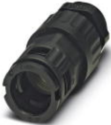
Cable gland, metric thread, IP68/69k protection, with strain relief

Please be informed that the data shown in this PDF Document is generated from our Online Catalog. Please find the complete data in the user's documentation. Our General Terms of Use for Downloads are valid ( http://phoenixcontact.com/download )