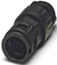
Cable gland, metric thread, IP66 protection, with strain relief

Please be informed that the data shown in this PDF Document is generated from our Online Catalog. Please find the complete data in the user's documentation. Our General Terms of Use for Downloads are valid ( http://phoenixcontact.com/download )