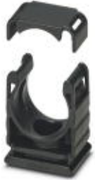
Hose holder with cover

Please be informed that the data shown in this PDF Document is generated from our Online Catalog. Please find the complete data in the user's documentation. Our General Terms of Use for Downloads are valid ( http://phoenixcontact.com/download )