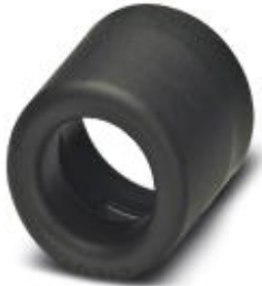
End sleeves as cable protection

Please be informed that the data shown in this PDF Document is generated from our Online Catalog. Please find the complete data in the user's documentation. Our General Terms of Use for Downloads are valid ( http://phoenixcontact.com/download )