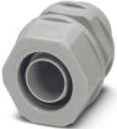
Cable gland made from PP with metric thread, IP65 protection

Please be informed that the data shown in this PDF Document is generated from our Online Catalog. Please find the complete data in the user's documentation. Our General Terms of Use for Downloads are valid ( http://phoenixcontact.com/download )