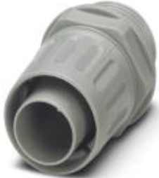
Cable gland made from PP with metric thread, rotatable, IP54 protection

Please be informed that the data shown in this PDF Document is generated from our Online Catalog. Please find the complete data in the user's documentation. Our General Terms of Use for Downloads are valid ( http://phoenixcontact.com/download )