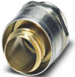
Cable gland made from brass with metric thread, rotatable, IP40 protection

Please be informed that the data shown in this PDF Document is generated from our Online Catalog. Please find the complete data in the user's documentation. Our General Terms of Use for Downloads are valid ( http://phoenixcontact.com/download )