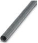
Protective hose in stainless steel

Protective hose - WP-STEEL S 27 - 3240864