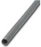
Protective hose in galvanized steel

Protective hose - WP-STEEL ZC 27 - 3240866