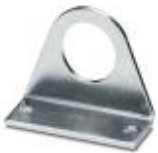
Fixing bracket for protective sleeves, fixed with two screws

Protective hose fixing bracket - WP-BASE A PG21 - 3241080