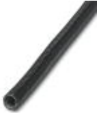
Galvanized steel protective hose with PVC coating

Protective hose - WP-STEEL PVC C 27 - 3240871