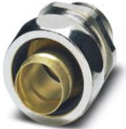
Cable gland made from brass with metric thread, IP65 protection

Please be informed that the data shown in this PDF Document is generated from our Online Catalog. Please find the complete data in the user's documentation. Our General Terms of Use for Downloads are valid ( http://phoenixcontact.com/download )