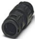
Cable gland, metric thread, IP66 protection, with strain relief

Screw connection - WP-GR HF IP66 M40 BK - 3240957