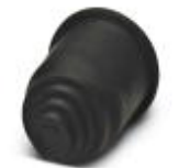
End sleeves, transition sleeves, from hose to cable

Transition sleeve from hose to cable - WP-EC TPE HF 42,5 BK - 3240980