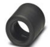
End sleeves as cable protection

Cable protection end sleeve - WP-SC PA HF 42,5 BK - 3240987