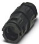
Cable gland, metric thread, IP68/69k protection, with strain relief

Screw connection - WP-GR HF IP69K M40 BK - 3240943