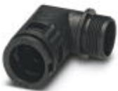
Cable gland, metric thread, IP66 protection, angled

Screw connection - WP-GA HF IP66 M40 BK - 3240929