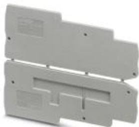
End cover, length: 90.8 mm, width: 2.2 mm, height: 33.8 mm, color: gray

Please be informed that the data shown in this PDF Document is generated from our Online Catalog. Please find the complete data in the user's documentation. Our General Terms of Use for Downloads are valid ( http://phoenixcontact.com/download )