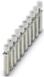
Screw bridge, with insulating collar, pitch: 8.2 mm, number of positions: 10, color: silver

Please be informed that the data shown in this PDF Document is generated from our Online Catalog. Please find the complete data in the user's documentation. Our General Terms of Use for Downloads are valid ( http://phoenixcontact.com/download )