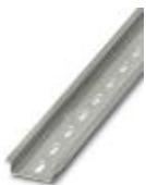
DIN rail, material: steel galvanized and passivated with a thick layer, perforated, height 7.5 mm, width 35 mm, length: 2000 mm

DIN rail perforated - NS 35/ 7,5 PERF 2000MM - 0801733