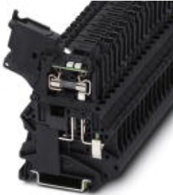
Lever-type fuse terminal block, black, for 5 x 20 mm G fuse inserts, with LED for 24 V DC

Please be informed that the data shown in this PDF Document is generated from our Online Catalog. Please find the complete data in the user's documentation. Our General Terms of Use for Downloads are valid ( http://phoenixcontact.com/download )