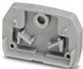
End cover, length: 32 mm, width: 4 mm, height: 20 mm, color: gray

Please be informed that the data shown in this PDF Document is generated from our Online Catalog. Please find the complete data in the user's documentation. Our General Terms of Use for Downloads are valid ( http://phoenixcontact.com/download )