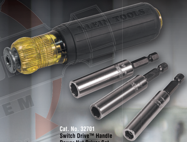
Cat. No. 32701 Switch Drive™ Handle Power Nut Driver Set