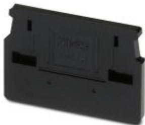
End cover, length: 42 mm, width: 3.5 mm, height: 26 mm, color: black

Please be informed that the data shown in this PDF Document is generated from our Online Catalog. Please find the complete data in the user's documentation. Our General Terms of Use for Downloads are valid ( http://phoenixcontact.com/download )