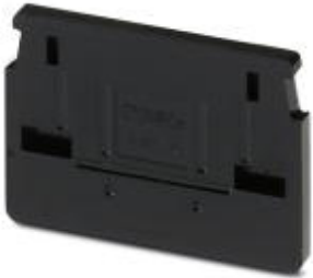
End cover, length: 46 mm, width: 3.5 mm, height: 30.7 mm, color: black

Please be informed that the data shown in this PDF Document is generated from our Online Catalog. Please find the complete data in the user's documentation. Our General Terms of Use for Downloads are valid ( http://phoenixcontact.com/download )