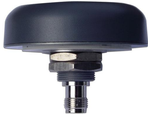
TW3400 Dimensions (mm)

Flat radome is shown, Conical Radome also available