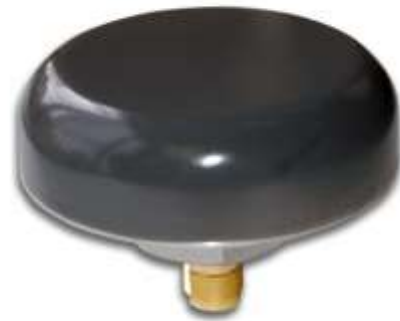
TW3600 Dimensions (mm)

The TW3600 is housed in a permanent mount industrial-grade weather-proof enclosure and comes with a TNC Jack (female) connector, allowing for the Iridium™ modem to be mounted out of the elements and reach, and still providing excellent Iridium™ signal coverage.