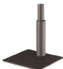
Model: 960-06 Mount Stand, 6" (127mm)