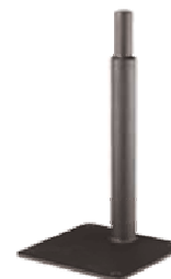
Model: 960-09 Mount Stand, 9" (203.2mm)

Click on any of the above images to find out more about the products pictured.