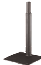
Model: 960-09 Mount Stand, 9" (203.2mm)

Website and content, copyright PanaVise Products, Inc. 1996 - 2011. PanaVise, PanaPress, PV Jr, Posi-Stop, Slimline, Slimline 2000, Uniflex, Stay-Put, PortaGrip, PortaGrip 2000, InDash, WindowGrip, Deluxe Multi Media Mount, Clip Caddy, and Vise Buddy are registered trademarks or trademarks of PanaVise Products, Inc. in the U.S. and in other countries. PanaVise's products are protected under one or more of the following U.S. Patents: 2,898,068; 3,661,376; 5,118,058; 5,187,744; 5,465,932; D390,849; D582,894. Patents pending on additional products in the U.S. and in other countries. PanaVise has a long history of vigorously prosecuting violations and/or protecting both its physical and intellectual property rights. All PanaVise Products are covered by a Limited Lifetime Warranty