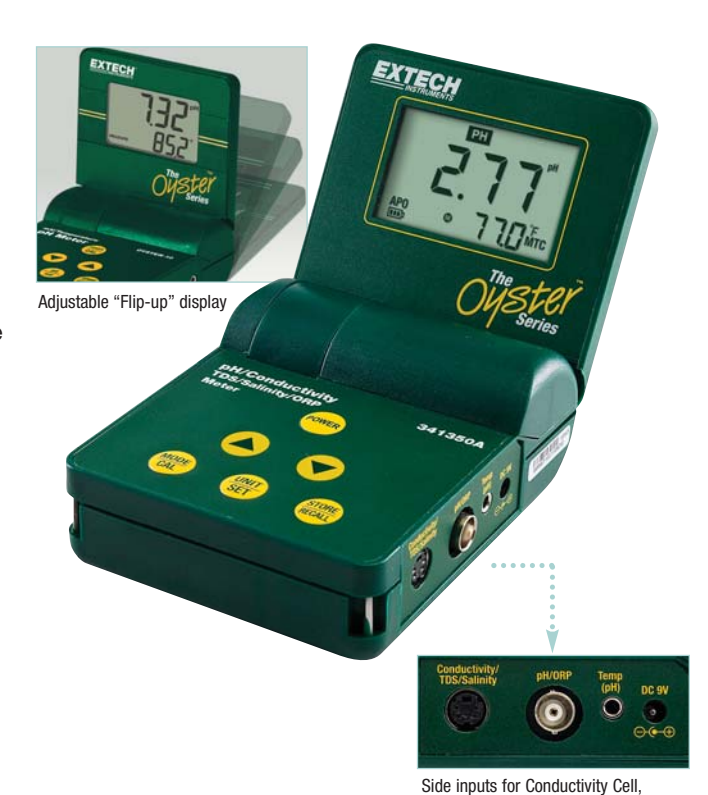
pH/ORP probe, Thermistor probe, and AC Adaptor