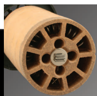
DuraTherm™ Heating Element