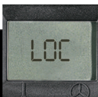
LOC Lockable Override Control