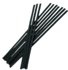
ThermoFlex™ Welding Rods 12" x 1.1" x 0.6" No. 07352