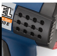
Dual Air Filters