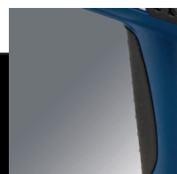
Soft Grip Handle