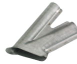
Plastic Welding Nozzle 2.0" x 1.3" x .4" No. 07091