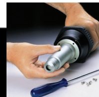
Field Changeable Element