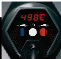
3 Stage Air Control