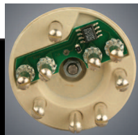
SmartChip™ Plug-In DuraTherm Heating Element