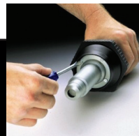
Field Changeable Element