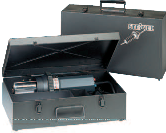
Heavy Duty Metal Case 17.9" x 5.4" x 10.2" No. 40090