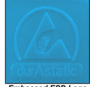
Embossed ESD Logo

Specifications and procedures subject to change without notice. Unless otherwise noted, tolerance is ±10%.