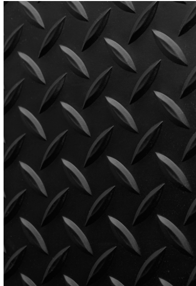
Diamond Embossed Pattern