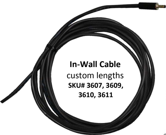
In-Wall Cable custom lengths SKU# 3607, 3609, 3610, 3611

Inspired LED's unique line of Interconnect Accessories are compatible with 3.5mm x 1.3mm DC input/output jacks. Cables are available in standard or custom lengths, and all interconnect products combine easily with Inspired LED flex strips and LED panels to create the perfect low-voltage lighting system for any location.