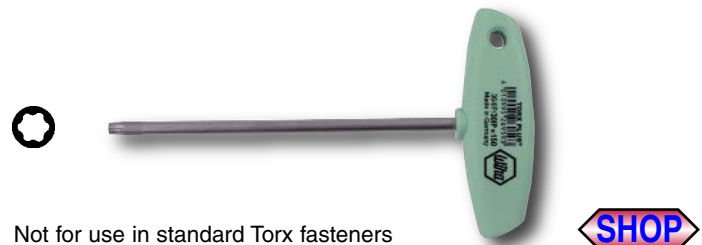
Not for use in standard Torx fasteners