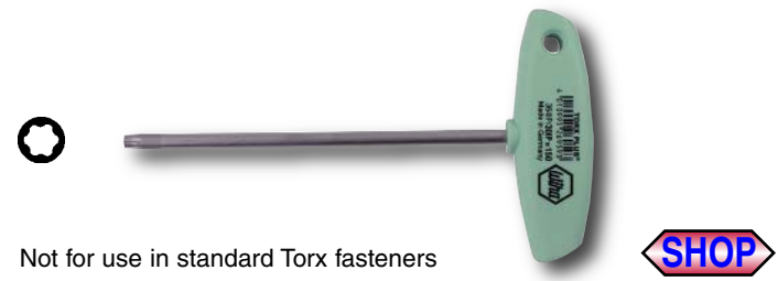
Not for use in standard Torx fasteners