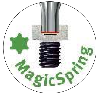
Screw Holding TORX® Tools Index

See MagicSpring TorqueControl Blades on Page 37