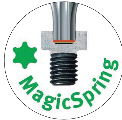
Screw Holding TORX® Tools