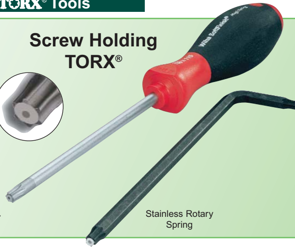
Stainless Rotary Spring