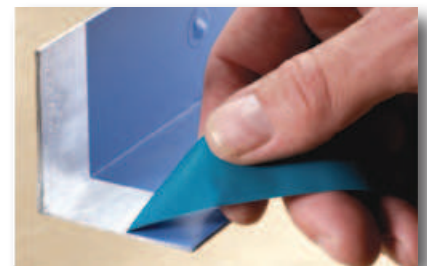
Clean removal, sharp paint edge.