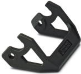
Single locking latch for B6 housing, HC-EVO....AL and HC-STA....AL

Please be informed that the data shown in this PDF Document is generated from our Online Catalog. Please find the complete data in the user's documentation. Our General Terms of Use for Downloads are valid ( http://phoenixcontact.com/download )