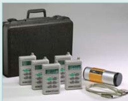
407355-KIT-5 Dosimeter Kit

Includes PC Windows® compatible software to maintain records and statistically analyze acquired data