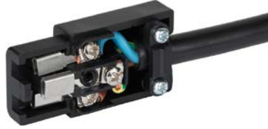
Example with assembled cable