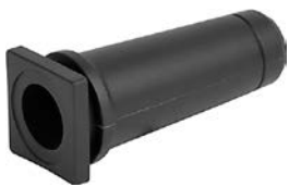
Cable Guard KT14 PVC Cable Guard for rewireable connectors