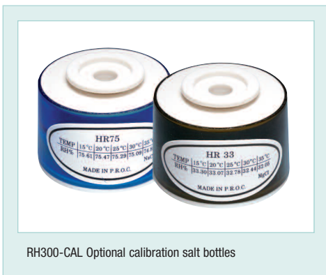
RH300-CAL Optional calibration salt bottles