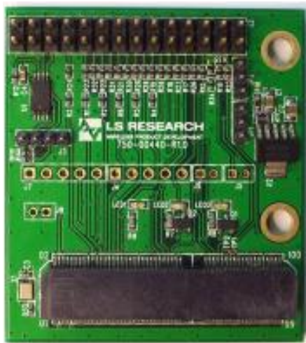
COM6L to BeagleBoard Adapter

The COM6L to BeagleBoard Adapter is designed for use with both the COM6L-T5 (TiWi5) Adapter Card and the COM6L-BLE (TiWi-BLE) Adapter Card.