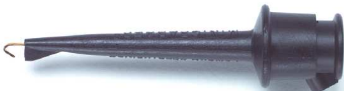
Model 4555 Do-It-Yourself Minigrabber Test Clip